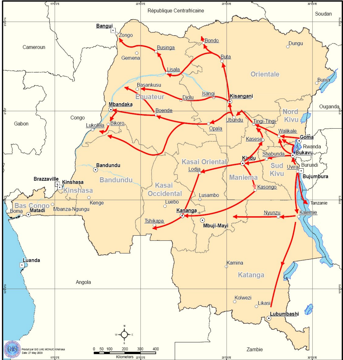
LA FUITE DES REFUGIES (1996-1997)